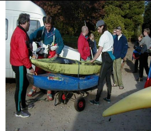
Ribble C.C. promotes the use of safe and approved mechanical methods of transporting craft.