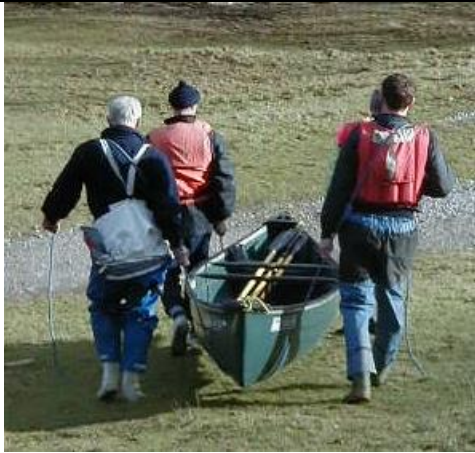
Ribble C.C. promotes working in teams to share the load and reduce the risk of injury.