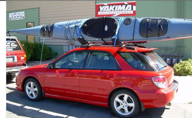
Please also take care when loading and ensure that all kayaks, canoes etc are safely secured to vehicles prior to transport. It is a criminal offence and can be extremely dangerous to other if you neglect this area.