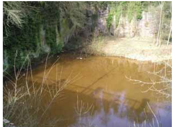
Start of the 42 miles of underground tunnels at Worsley Delph

My starting point is Worsley, many of you may already know but the water here can only be described as ‘Rusty Tin’ coloured. This colour is a result of all the iron ore seeping from the 42 miles of underground tunnels where Francis Edgerton, the Duke of Bridgewater’s mining empire lay. The underground canal network reaches up to Farnworth and across to Bolton and was finally sealed and closed up in the early 1960’s. Entrances to the mines are still visible today at Worsley Delph.