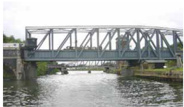
Barton swing Aqueduct from the M/C Ship canal

Rounding the corner at Barton I can see the swing Aqueduct ahead and it's open. I used to visit this place as a small boy on a Sunday afternoon and wait to watch the giant Manchester Liners gently steam up the ship canal towards Manchester Docks. At the entrance to the aqueduct is a viewing platform that overlooks the road bridge, the ship canal and the Bridgewater canal. Nearly 50 years on and I am about to achieve a life long ambition of crossing over the aqueduct.