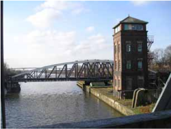
View off the Aqueduct towards M60

up to 400 tons to reach close to the centre of Manchester.