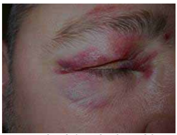
Graveyard rash from that big Welsh river

bang!... oops another rock... sh**... bang!... I know, I'll smash me knee through the spraydeck..... bang... right into another rock... bang!... sh**... I think I'm drowning..... aah bliss... I've escaped... swim... rock... bang!... s**t... paddle... bang!... sh**... bang!... you get the picture.