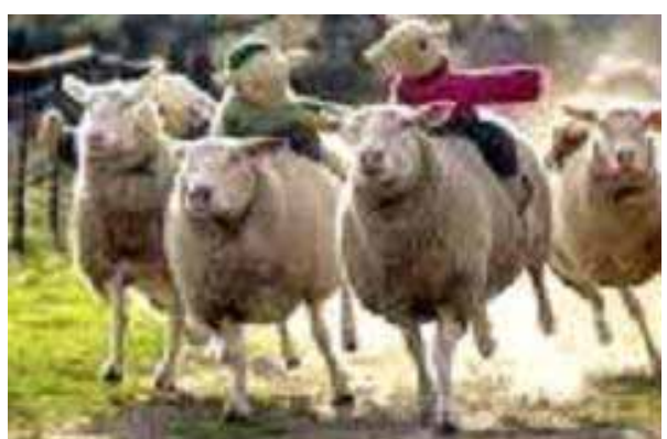
Quick! Run! The Swim Team's back in town!

Anyway, off we set through the fog and into the valleys, we wandered around for 2 hours before we discovered we were at Lluckinglost, somewhere near the Shitweryn Wales. A further ½ hour later and we found our way and arrived at the Welsh National Whitewater Centre.