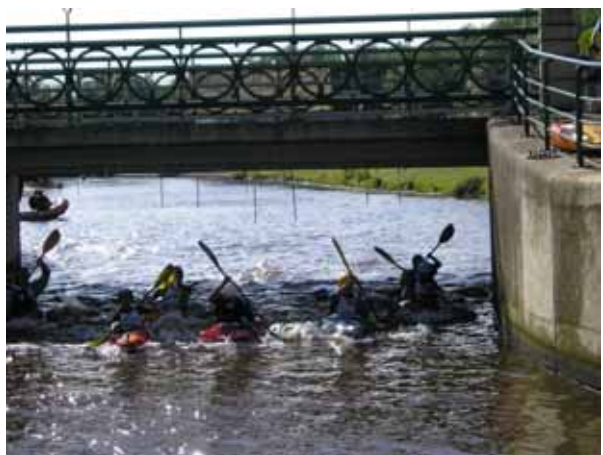
The Under 18's coming off the top lake and heading onto the course in the Boater Cross.

into the course. I was making good progress and my arms were starting to ache. I went through Happy Eater, got slowed so that the person I had previously overtook started to catch up. I went through the next hole, and got slowed even more; whereas the person behind me managed to avoid the hole and therefore overtook me.