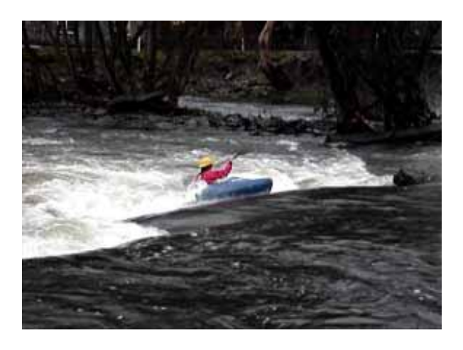
After the three age groups had completed the Boater Cross and the judges were in place at

The afternoon session was kicked off with a Boater Cross for each age group, which involved a kind of slalom race down the river in one group, but without the slalom poles. This, in short playboats, seemed extremely hard work. All I can remember about this event was overtaking someone who was stuck, side surfing the middle hole, and finishing with arms which felt like lead!