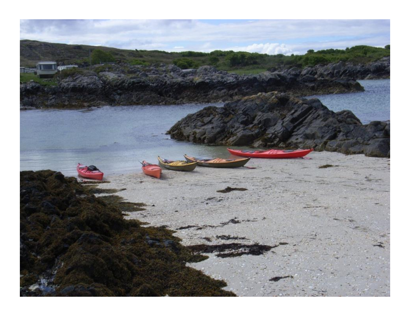
Nowhere in all the West Highlands and Islands have I seen any place of so intense or varied a beauty in so small a compass' – Gavin Maxwell