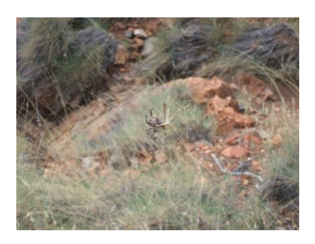
Part 2: A broken compass

Oh and I'm sure you all want to see a local spider, so here it is. Don't worry, there is a koala next.