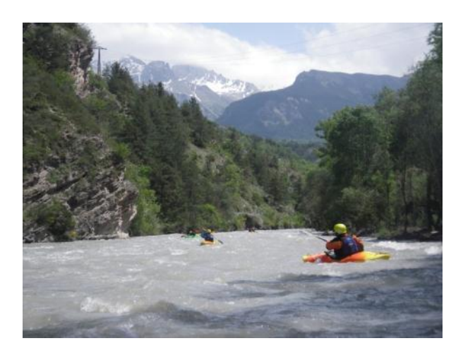
So 4 days in, 5 river trips, 2 epic swims, 1 demon faced and life grasped by the neck!

I entered knocking a slalom gate post with my paddle, confirming my line, I positioned centre and relaxed a little in anticipation, exchanging smiles with Sally. I saw the shape she made in front of me and I knew it felt right. Four power strokes to get up speed before the tongue dipped into the wave, as I had visualised, then a hard sweep on the right paddle to greet the wave at 11 O'clock. Body upright but forward, I rode over it, planting my blade on the left over the crest of the wave and pulling through from the abs, followed by a slight pause then planting a right blade, pushing with my left hand, over the next wave and I was through the wall. Upright! The next waves were like a flowing roller coaster, hips loose, looking forward. I positioned through the centre of the bridge and eddying river left. Brilliant, absolutely brilliant. I couldn't have felt more alive.