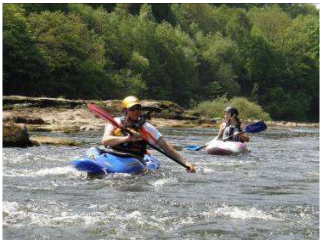
Dad & me at Halton

After another swim I didn't think I would be able to do it, but I never would if I just sat watching the others so went up for another try and managed two consecutive full runs which was amazing to do after my swims!