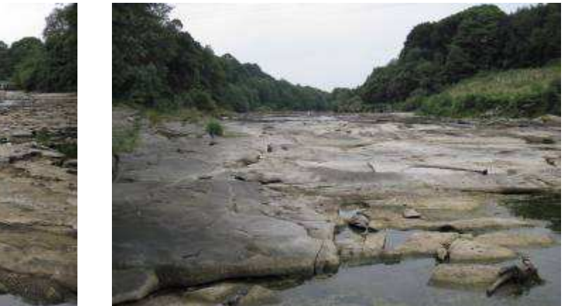
Looking downstream from forge weir