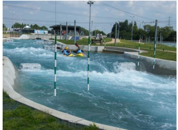
The legacy course

The legacy is a good course no rafts and some nice play spots. It's like Teeside without big eddy and acid drop. I just wish it was closer and I would be there every weekend!