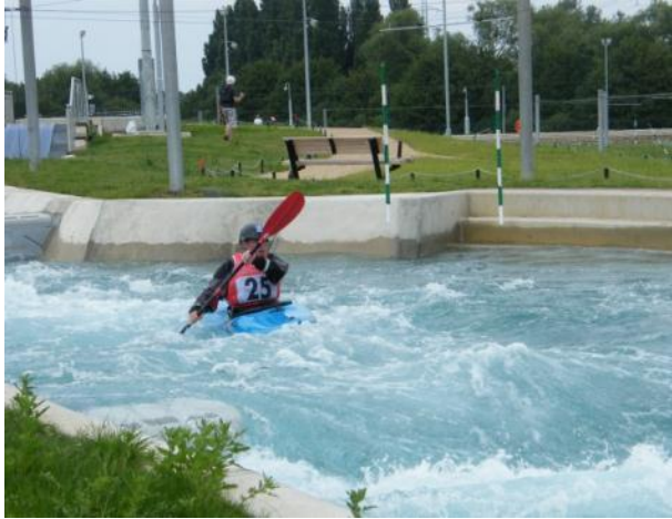
The legacy course

He agrees and says 'You have 15mins of your hour left, spend it on the legacy and I will sign your pass for that course.' So that's what I did, I then paid another £5.00 for an extra hour on the course.