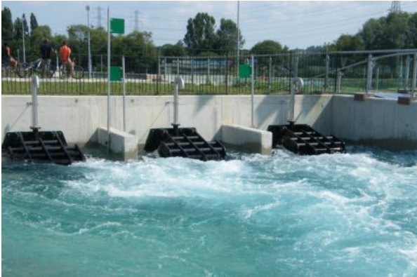
Three of the 4 pumps running

I later found out it cost £450.00 an hour just to run the pumps on the Olympic course so they leave it till the last minute to switch them on.