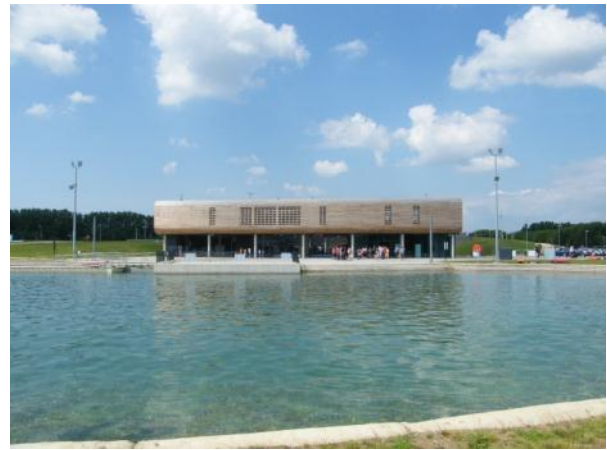
The lake and office

We then have to paddle back to the steps and do flat water roll – no problem.