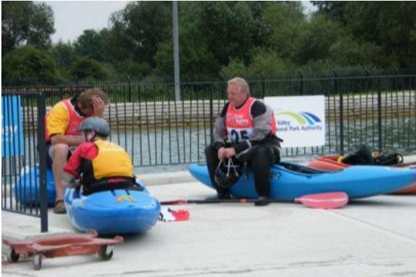
Waiting to go – that is the look of fear.

The legacy course was running so I went and looked round. The first thing you notice is that there are no big eddies, most are just big enough for 2 boats so there are no big groups of people waiting to get on the play waves.