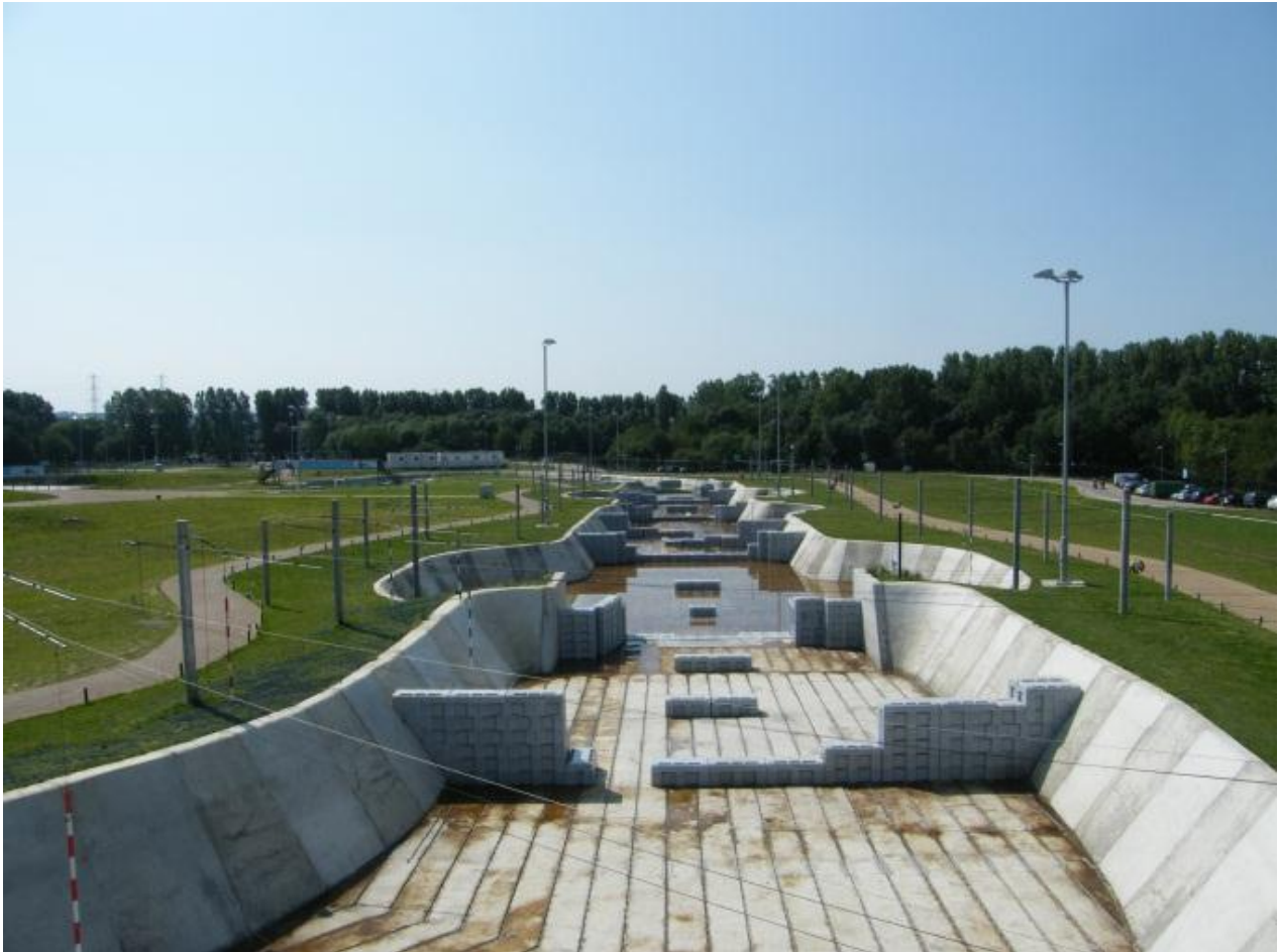
The course from the top

It all started some time ago when someone posted on the Club Forum that the Lee Valley White Water Olympic Course was open to the public and it would be a blast to go and paddle it, yes sounds fun to me.