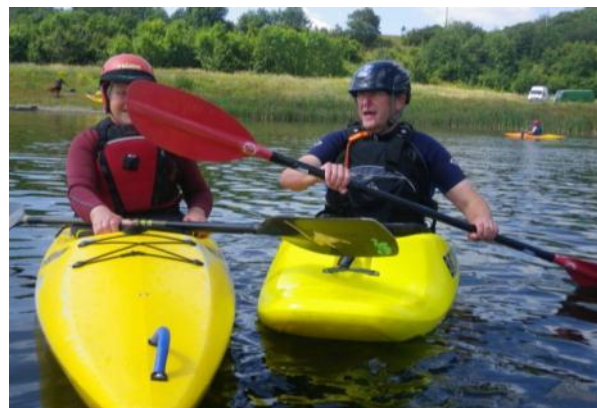
Looks like a near miss for the accident book

Overall conclusion: It's not Teeside or Cardiff, or the Tryweryn, or the Leven. But it's closer and cleaner than HPP! When there isn't any water anywhere else, it's a good deal better than nothing.