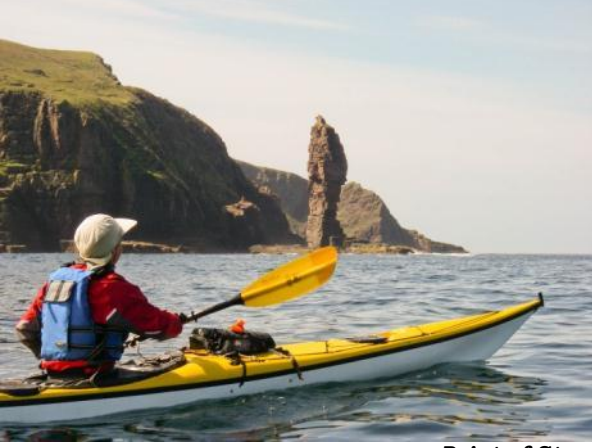
Point of Stoer

Another trip worth completing is out to Oldany Island and Drumbeg. Continuing by road from here can become a challenge, as it narrows and snakes it way over the hills to arrive back on the A894 near Kylesku, which provides another excellent venue, especially if the weather turns rough.