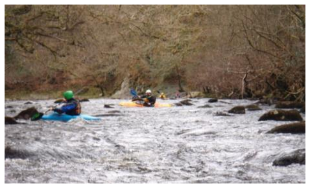
Some of the scrapes