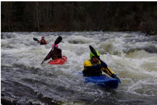
The girls love the quiet type

Well that's the first run done so time for a spot of lunch.