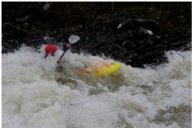
Allan when he is not talking

You get a short break now down to one of the bigger drops and there is a big eddy on river left for a rest and easy break in to get your line right to get down.