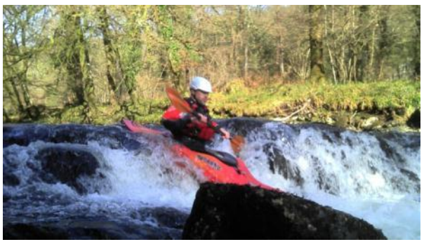
The VAT Man on the slide