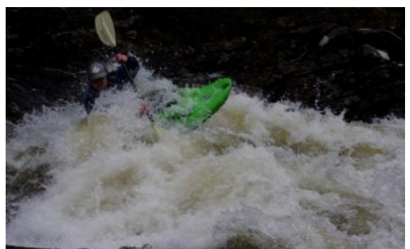
A chip of the old block me thinks

With my mind picturing the Washburn (a narrow tree riddled fast stream) I was not looking forward to it. How wrong can you get I was greeted by a wide moderately moving grade 3 river with lots of features. Although not as long as the Washburn it turned out to be lots more fun.