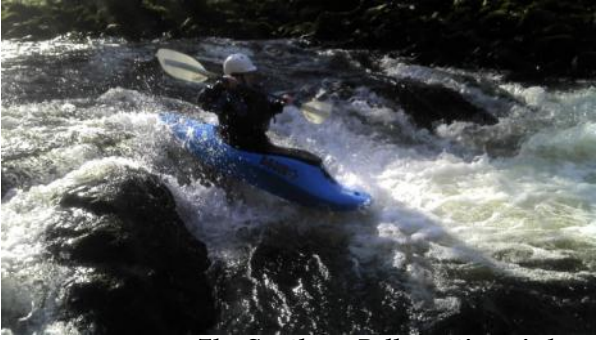
The Southern Belle getting air born