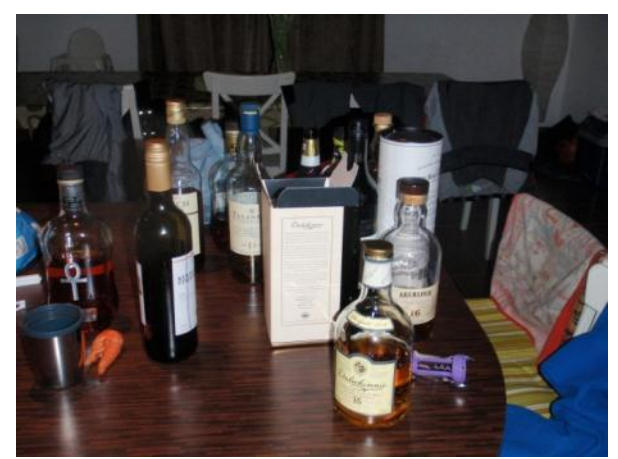
You have to wash it down with something

If you can think of a cheese we had it (I think everyone knew that the rivers down south were going to be low as no one mentioned paddling)!