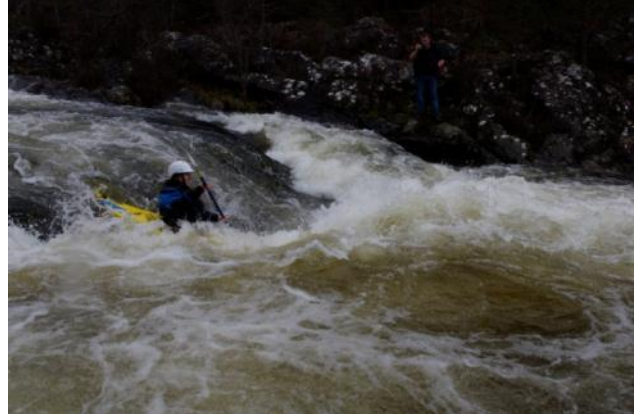
The Southern Belle

It is then just a short distance to a large hole which is easily avoided on river left, but not by me. Fortunately I had enough speed to get me through it, all be it the wrong way up glad I practiced my rolling as I now needed it. I noticed the Southern Belle had gone very quiet she would have given me some stick for getting it wrong, she must not be having the best of days herself.