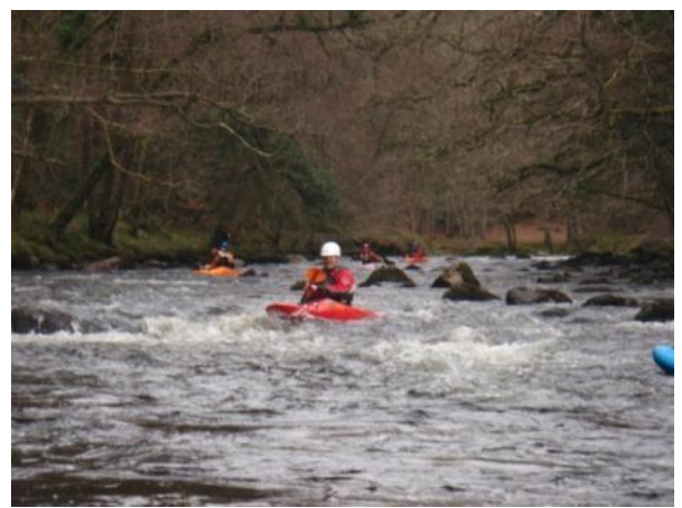
But we all got down ok