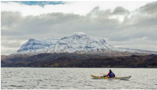
Loch a Chairn Bhain

If you want an easy passage it is worth checking local high water times.