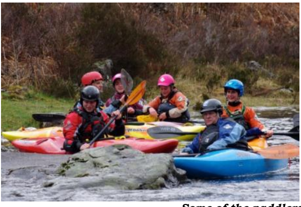
Some of the paddlers

The post went up on the forum for this year's Easter trip to Scotland so I posted I would go along with 20 or so others.