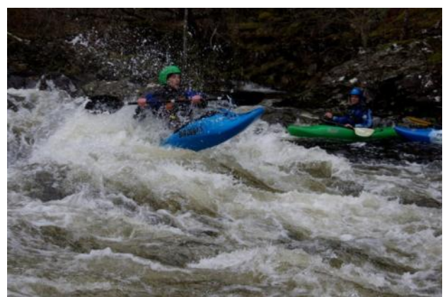
Nothing wooden or wobbly about this man

What can one say (c**p Paddler), was my first thought so I got a few practise rolls in and felt a bit better. Off we went and in just a few yards you are on the first drop, got through that ok and looked back to see I was not the only one to be a bit wobbly.